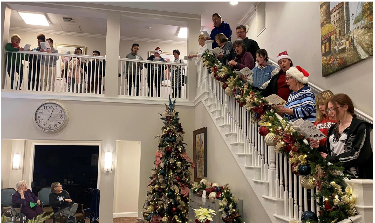
Some of our choir and youth group enjoyed caroling at Ridgecrest and The Fountains before Christmas. (Photo @ The Fountains)