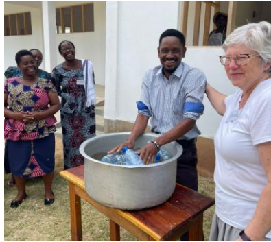
Bottle Exercise to See Visually What Happens when We Try to Hide our Feelings & Pain