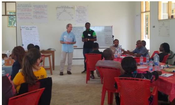
Story and Lesson with Swahili Translation