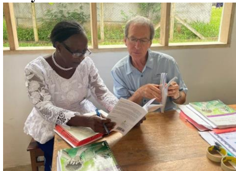
Learning to Use the Book for Lessons