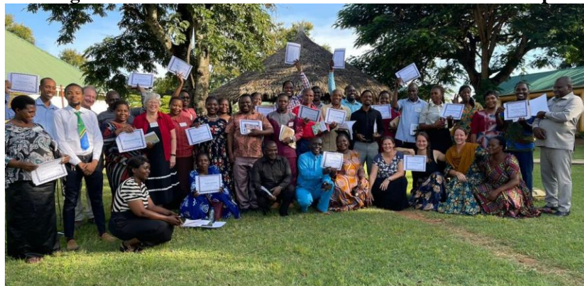
Apprentice Facilitators with Certificates – Congratulations!