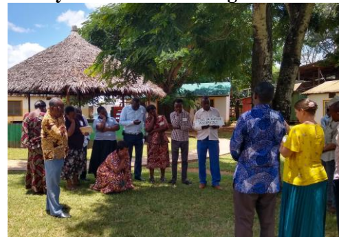
Acting out the Grief Journey