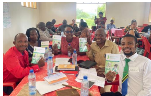
Table Group with New Swahili Books