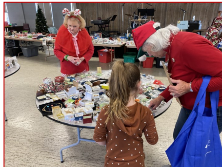
Shopping with the Elves

(simulcast online on our YouTube channel)